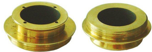
Image: Flex Adapter