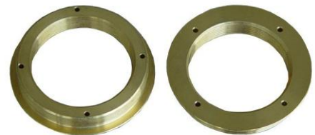
Image: Thread Adapter

We recommend ordering a MIPOS system with an M32x0.75 inside thread if your specific application requires the use of several lens diameters since it's easier to reduce the threading diameter from M32x0.75.